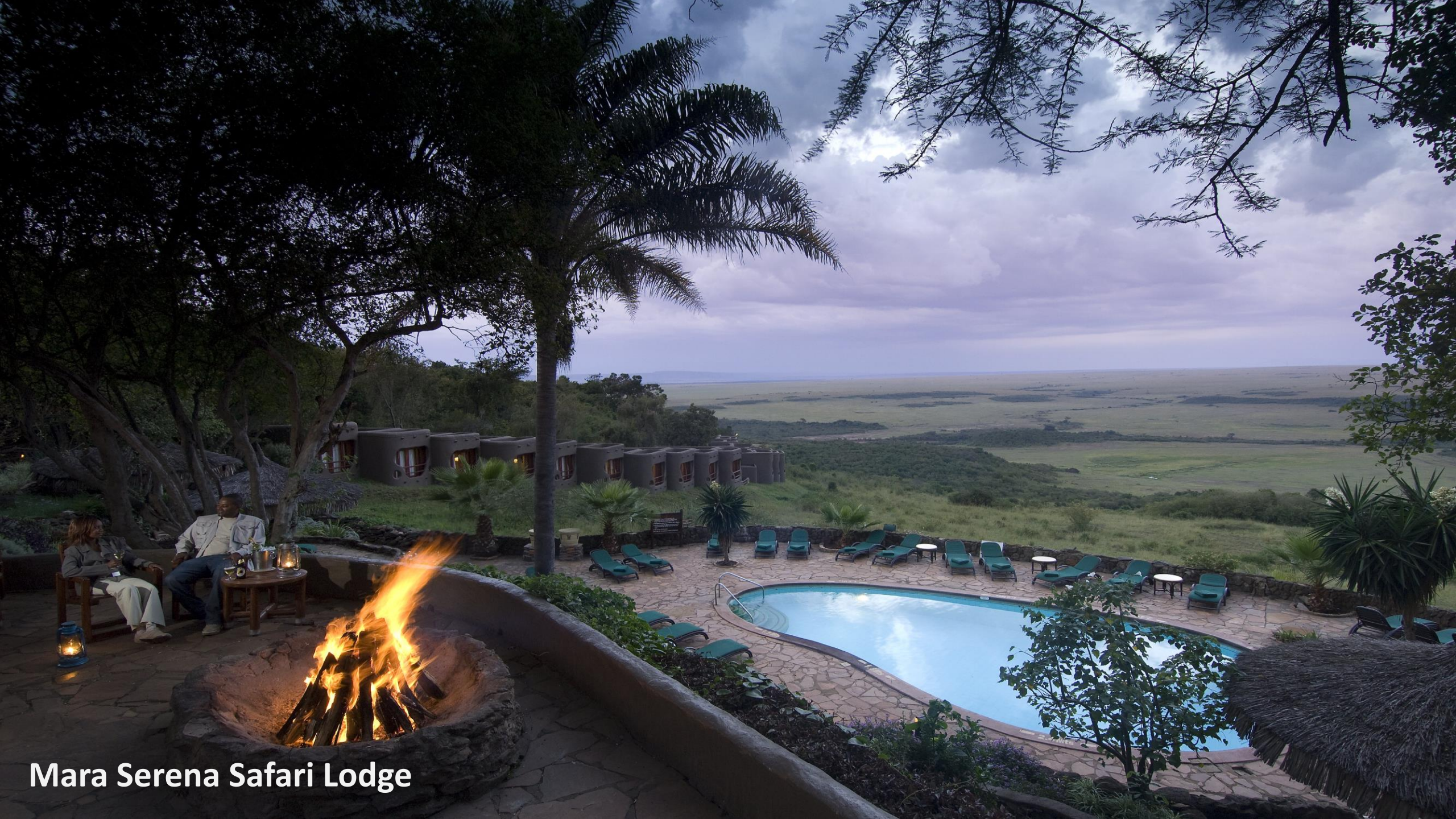
Mara Serena Safari Lodge